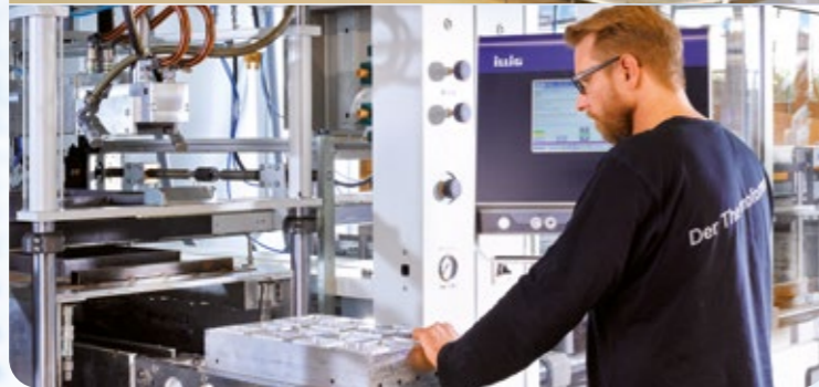
Roll automatic machine